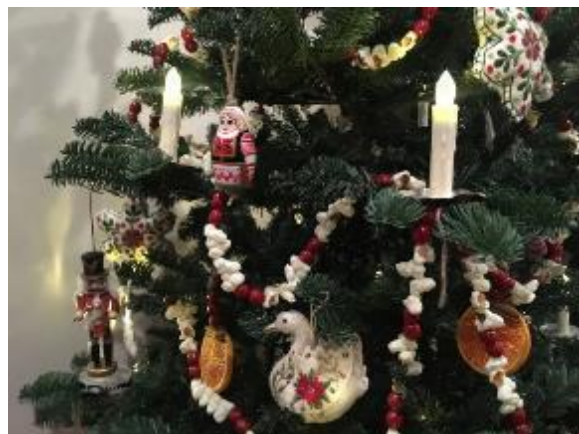
Some of the Handmade Ornaments