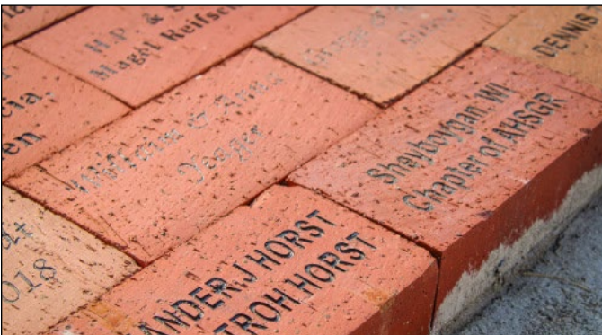
Recognize your family's German Russian heritage by purchasing a brick for the walkway at AHSGR Heritage Center.