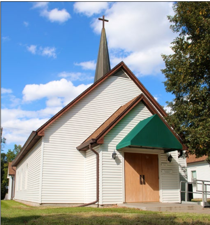
All Faiths Chapel at Headquarters Complex in Lincoln