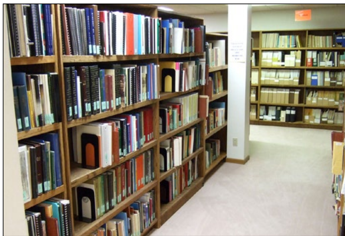
The AHSGR Research Library in Lincoln includes books, family histories, an ancestor database, and more.

The AHSGR Book Club is held quarterly via Zoom. A host moderates a discussion of a chosen book which relates to the history, culture, and heritage of the Germans from Russia people.