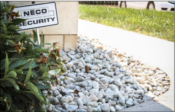
Thanks to the generous funding of our Give To Lincoln Day donors, the AHSGR Heritage Center building added new rock edging around the building perimeter. The rocks around the perimeter also covered areas where grass refused to grow and provides the building with better insulation, protection against bugs and rodents, will reduce mowing and mulching costs, and provides a more attractive and finished look to the structure.