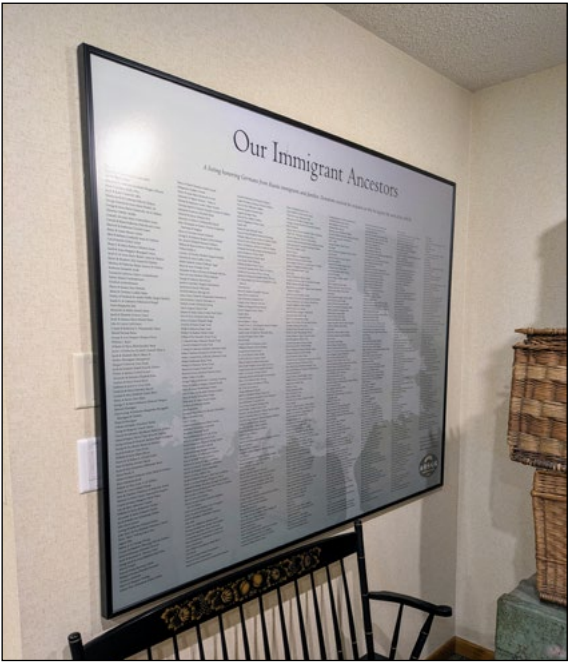
The panels for "Our Immigrant Ancestors," a collection of honorary plaques purchased to celebrate people of German Russian ancestry, have been reimagined and reinstalled near the Heritage Center's entrance to continue honoring those names and families.